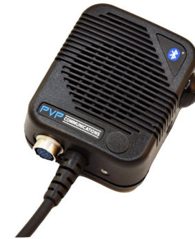
Motor Kit Pairing Switch