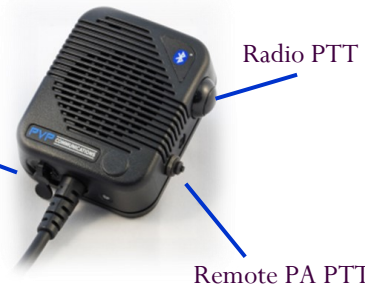
Remote PA PTT